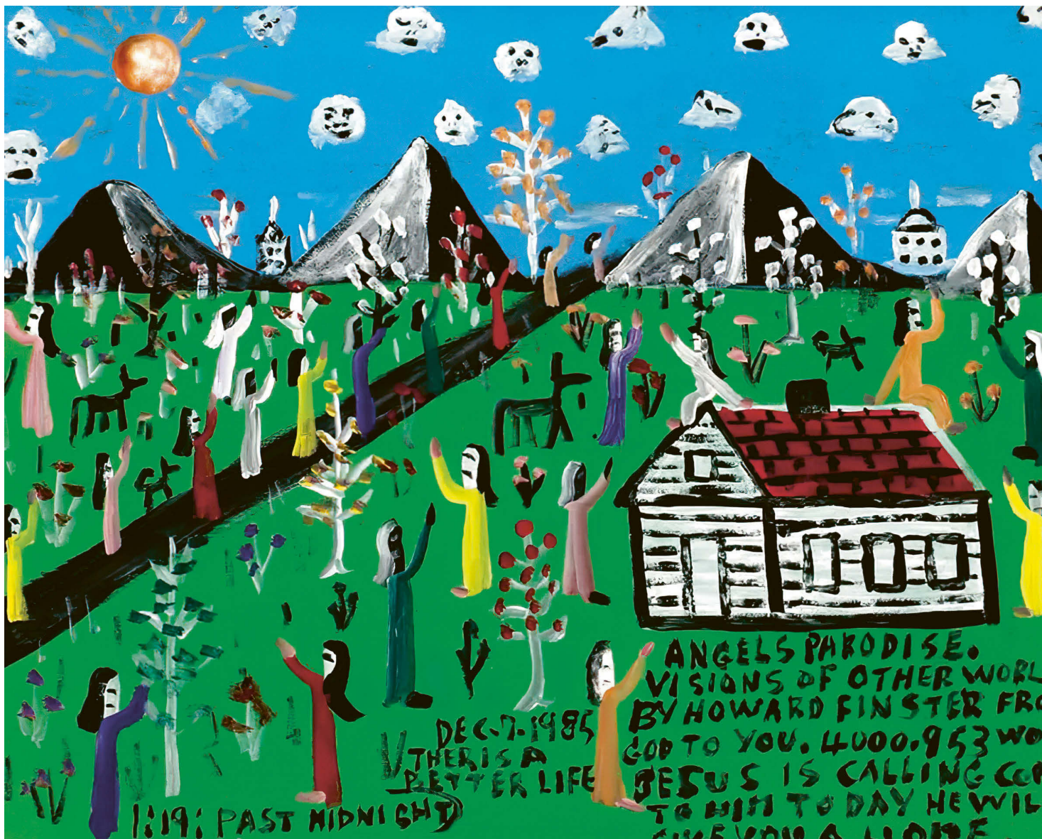
Angel's Paradise , 1985, by Howard Finster